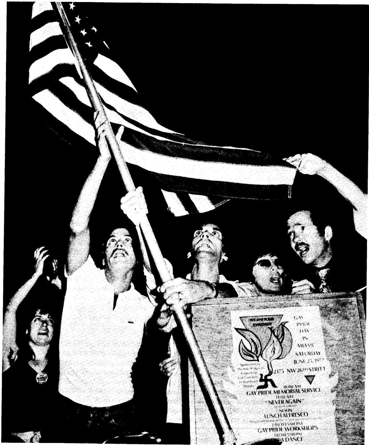
Gay activists celebrate at "non-victory" party in Dade County, Florida.