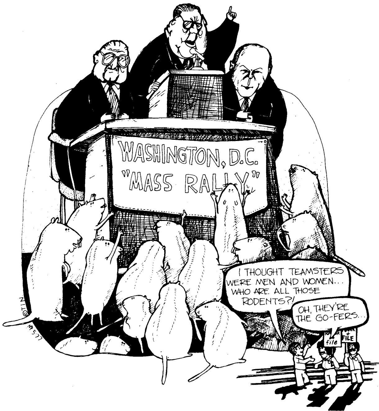
A "mass rally" of 2000 local officials in Washington, D.C., April, 1977, as seen by Teamster Information Network, a publication of Teamsters for a Democratic Union (TDU). TIN is available from PO Box 3321, Madison, WI 53704.