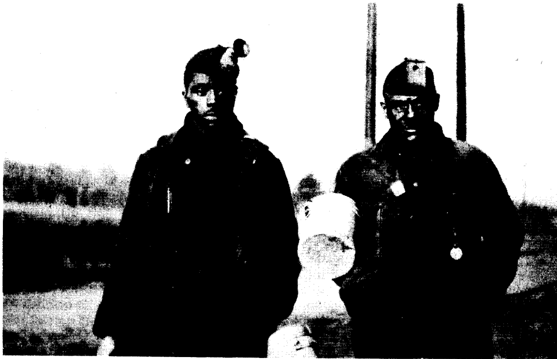
Steel Trust Coal Miners in Alabama, around 1928.